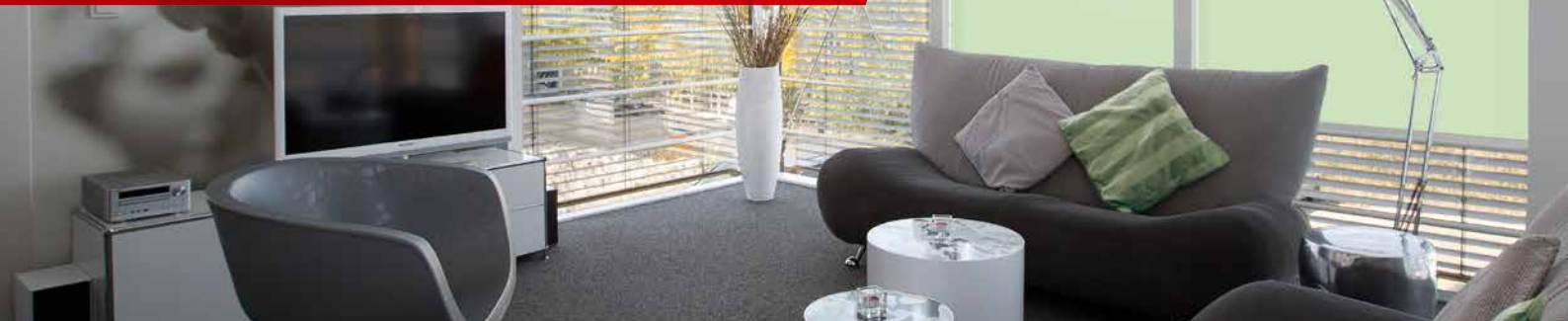
Cassette roller blind (rectangular cassette)